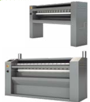
FLATWORK IRONERS Ø200 / Ø325 mm Ø500 / Ø650 mm