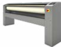
WALL IRONERS Ø180 / Ø250 mm