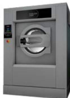
BARRIER WASHERS 16 TO 100 KG