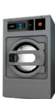
FRONT LOADING WASHERS 11 TO 120 KG