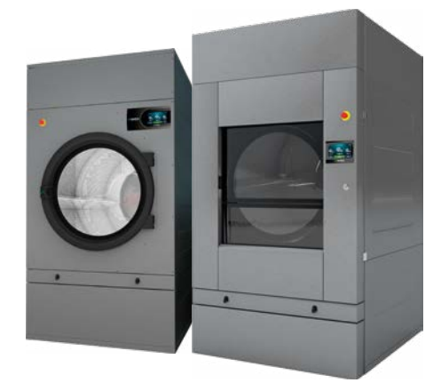
Single drum From 11 to 80 kg